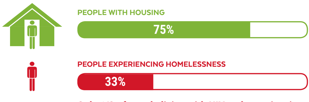
FIGURE 1: PERCENTAGE OF PEOPLE LIVING WITH HIV WHO ARE VIRALLY SUPPRESSED

Only 1/3 of people living with HIV and experiencing homelessness were virally suppressed in 2017.<sup>2</sup>